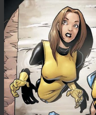
Phase Through Walls