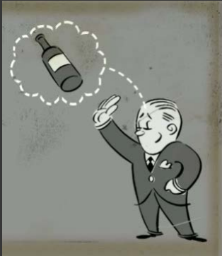
Levitate & Throw Objects